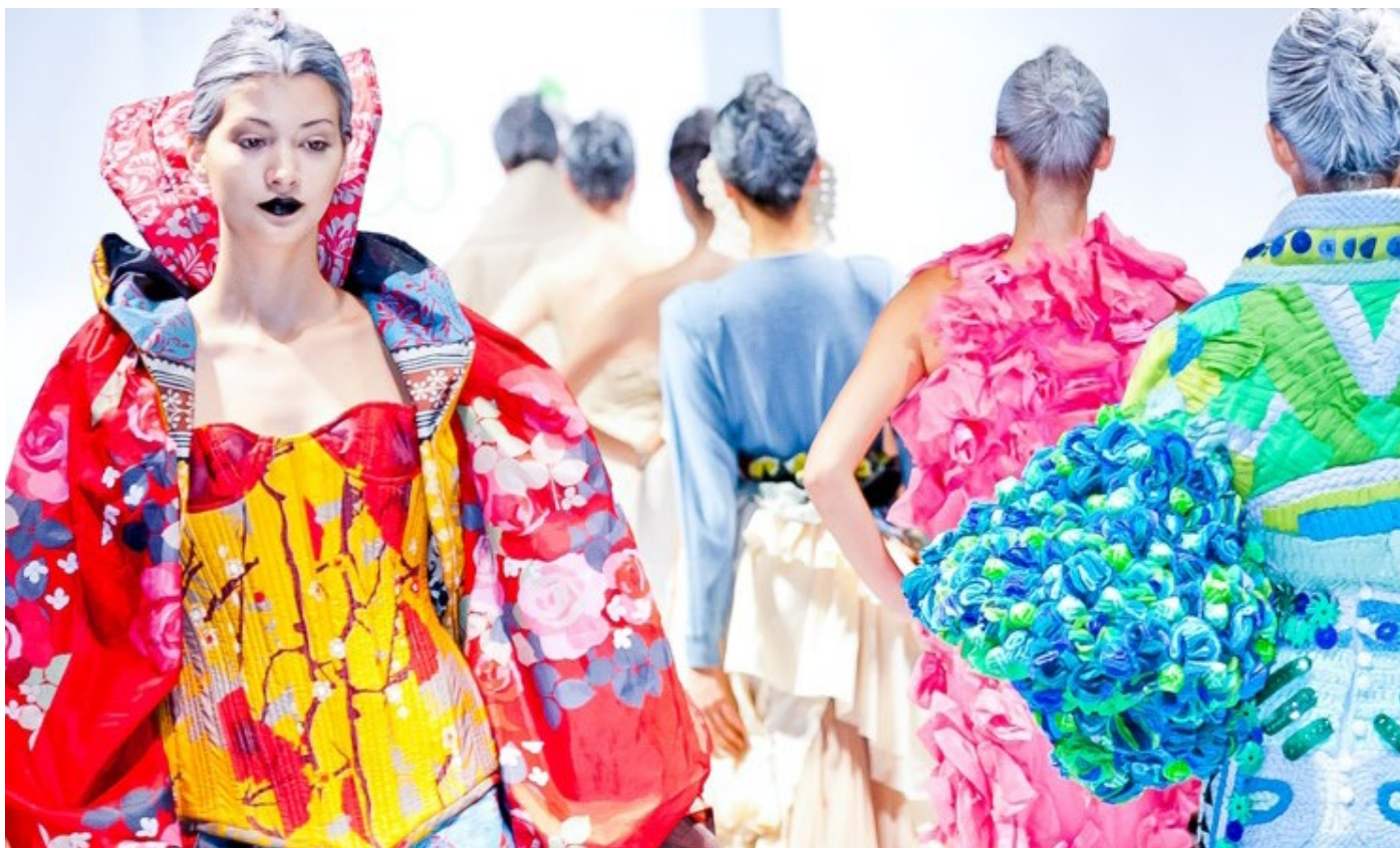
Up-cycled outfits in the finale at 'Redress on the Runway'.